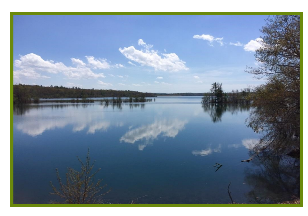
Ashokan Reservoir Rail Trail