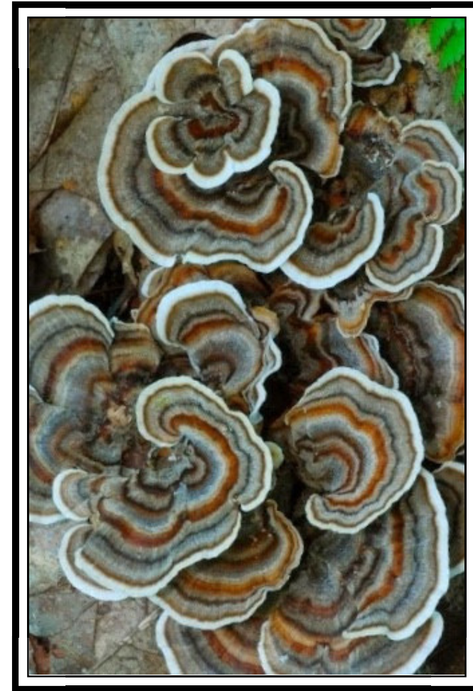
TurkeyTail Mushroom.