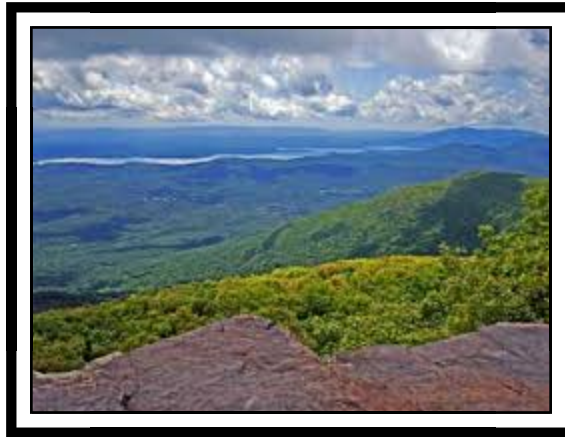
View from Overlook Mountain to Ashokan Reservoir

From our beginning, our work to protect undeveloped land has required your significant financial support. More than 500 people donated to purchase Zena Cornfield 30 years ago. We've also collaborated with Open Space Institute (OSI) to preserve an expanded region of Overlook Mountain (later conveyed to NYS DEC) and, with OSI support, conserved three of our seven properties atop Mount Guardian. In recent years we've opened new preserves with wonderful hiking trails. Our ambitious agenda continues to require your help, for large and small initiatives. Could you help us achieve some of the goals listed below? And always we welcome deeper conversations with those who may be able to do much more.