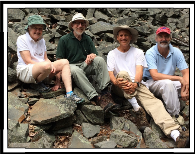
Snake Rocks Stewards

Current work on trails includes adding a new route to our existing 2-mile loop trail at Israel Wittman Sanctuary, which opened Fall 2017. At Snake Rocks, Tahawus Trails has professionally installed beautiful stone stairs for your ease and enjoyment.